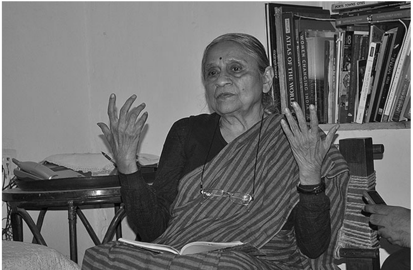
Ela Bhatt, Founder of SEWA

Elaben who is always surrounded by people seemed not worried about having so many of us sitting around her in her tiny room. While serving tea to guests, she also invited members to share their thoughts with her to start a meaningful and productive conversation.